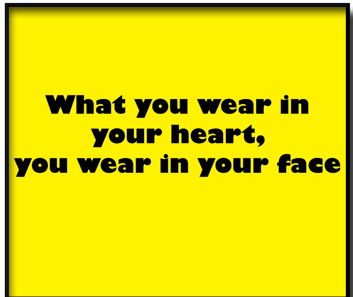
An original P3 by the one and only Minnie